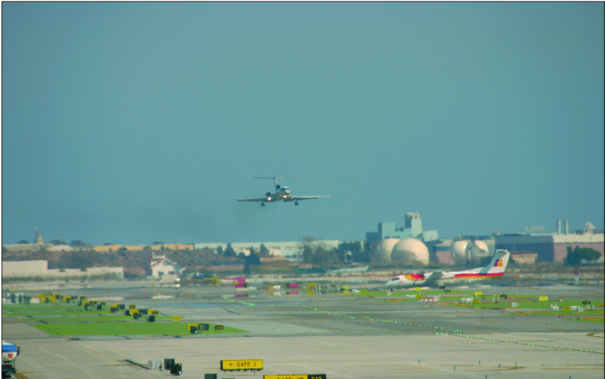
Photo 1. Aircraft approaching to taxiway T at the time a Dash-8 is leaving the taxiway T