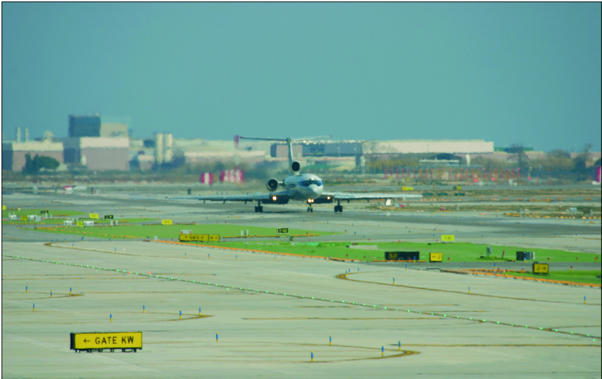
Photo 2. Aircraft landing on taxiway T