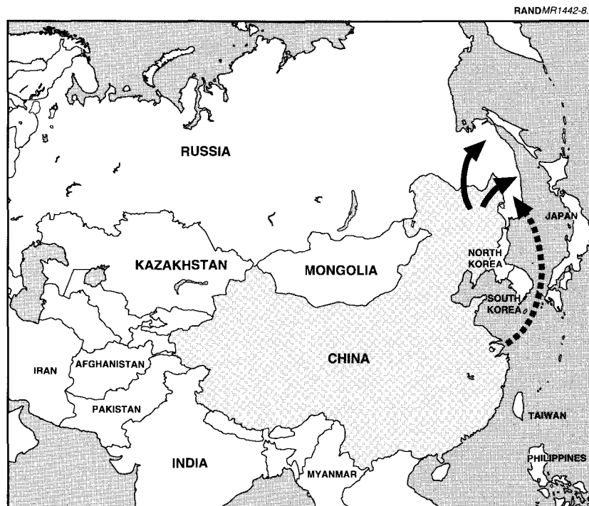
Figure 8.1—Chinese Force Movements

China's strategy for acquiring the territory is based on a plan to provoke Russia into attacking Chinese forces in the region. China, pleading self-defense, could then counterattack into Russia. Beijing, possessing by now a large strategic nuclear force, is confident that Moscow will not risk nuclear war and the destruction of European Russia to defend the poor and underpopulated Far East. The People's Liberation Army (PLA) therefore begins to shift more forces toward the border with Russia. The plan goes awry, however, when Chinese forces get into a firefight with Russian border guards near the border at the Ussuri River. Chinese commanders on the scene seize territory in Primorsky Krai; the weak and disorganized Russian forces in the region are able to put up little resistance. With this fait accompli , Beijing orders its navy to gear up for an amphibious landing at Vladivostok and elsewhere on the coast. See Figure 8.1.